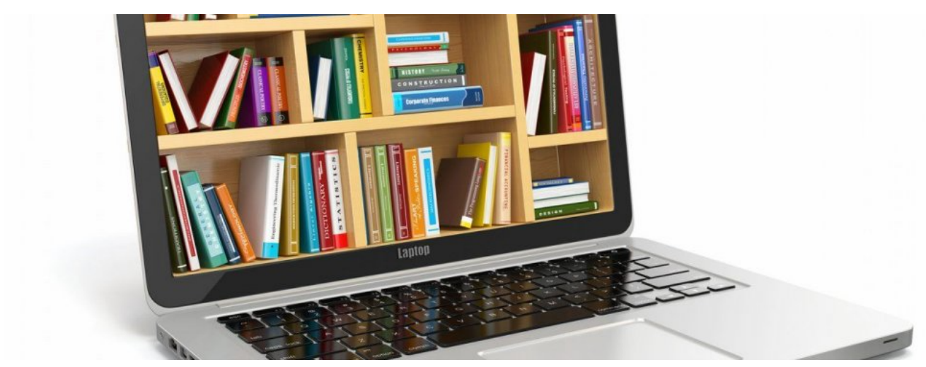
On-Demand Virtual Training Library

You can access a variety of on-demand webinars through the Training Tab on our homepage or you can click the links below to learn more: