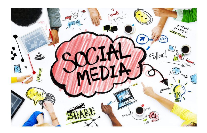
Follow us on LinkedIn, Instagram, Facebook, and Twitter

Take me to the forum: https://hsistemhub.org/cb/.